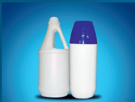
BOTTLES (Liquid Packaging) 1Ltr range