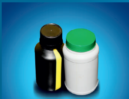
BOTTLES (Liquid Packaging) 900ml to 100ml