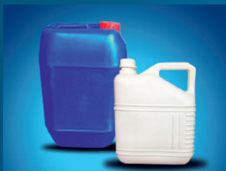
JERRY CANES (Liquid Packaging) 20 Ltr to 10 Ltr

We have a complete range of HDPE bottles, jars and jerrycanes ranging from 100 ml to 20 ltrs. Our products are food grade, corrosion free, odour less and non-toxic. They are safe for use with all forms of industrial and hazardous chemicals, solvents, powders, gels etc. Our products conform to ISO standards and export requirements of different countries.