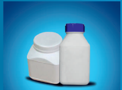
RANGE OF JARS (Powder and Paste Packaging)