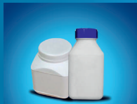
RANGE OF JARS (Powder and Paste Packaging)