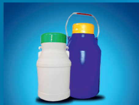
VETINARY (Animal Feed) Products

You may contact us in whatever way convenient to you. We are available 24/7 via email or telephone. You can also visit our office personally. Alternatively you may email us with any questions or inquiries or use our contact data. We would be happy to hear from you.