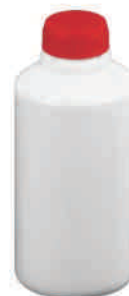
500 ml. (Bottle)

These containers are suitable for food content & meet the requirements of the food safety & Standard Act.