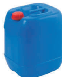
25 Ltrs. (Altno)

These containers are suitable for food content & meet the requirements of the food safety & Standard Act.