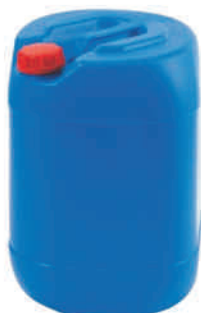
30 Ltrs. (Jumbo)