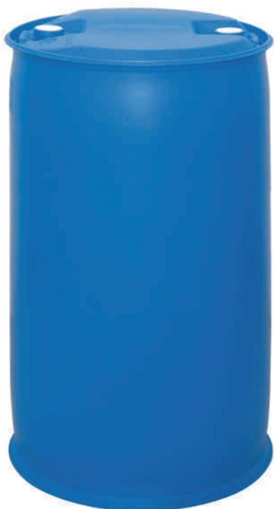
250 / 235 Ltrs.