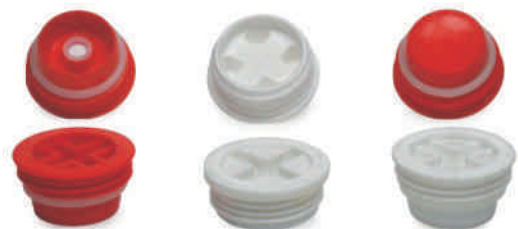
Barrel Bungs / Vented Bungs