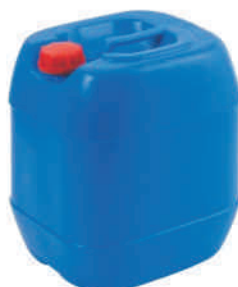
30 Ltrs. (Altno)