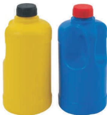
1 Ltr. (Round Handle Bottle)