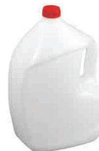
5 Ltrs. (Handle Jerry Can)

These containers are suitable for food content & meet the requirements of the food safety & Standard Act.