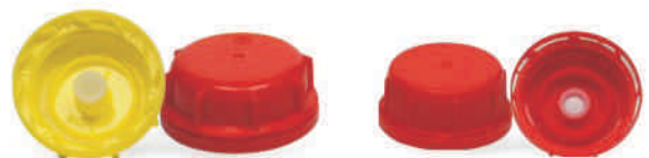
Temper Proof Cap / Vented Cap