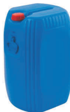
50 Ltrs. RIBS