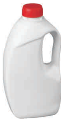
1 Ltr. (Handle Bottle)