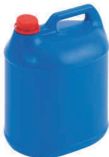
5 Ltrs. (Half Round)