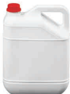
5 Ltrs. (Classic)