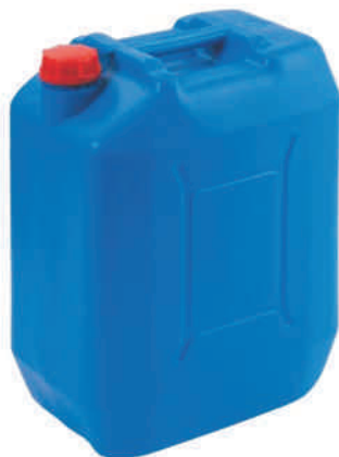
35 Ltrs. (Jerry Can)