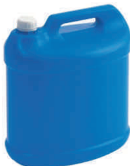
10 Ltrs. (Half Round)