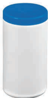
1 Ltr. (Jar)