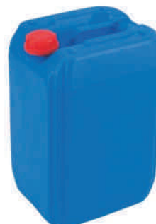
25 Ltrs. RIBS