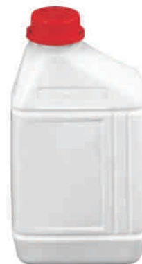
1 Ltr. (Classic)