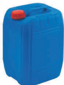
20 Ltrs. RIBS