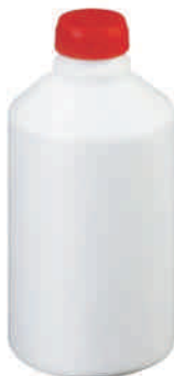
1 Ltr. (Round Bottle)