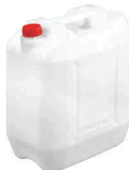
10 Ltrs. (Stakable)