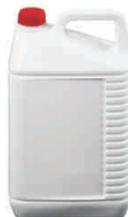
5 Ltrs. (RIBS)